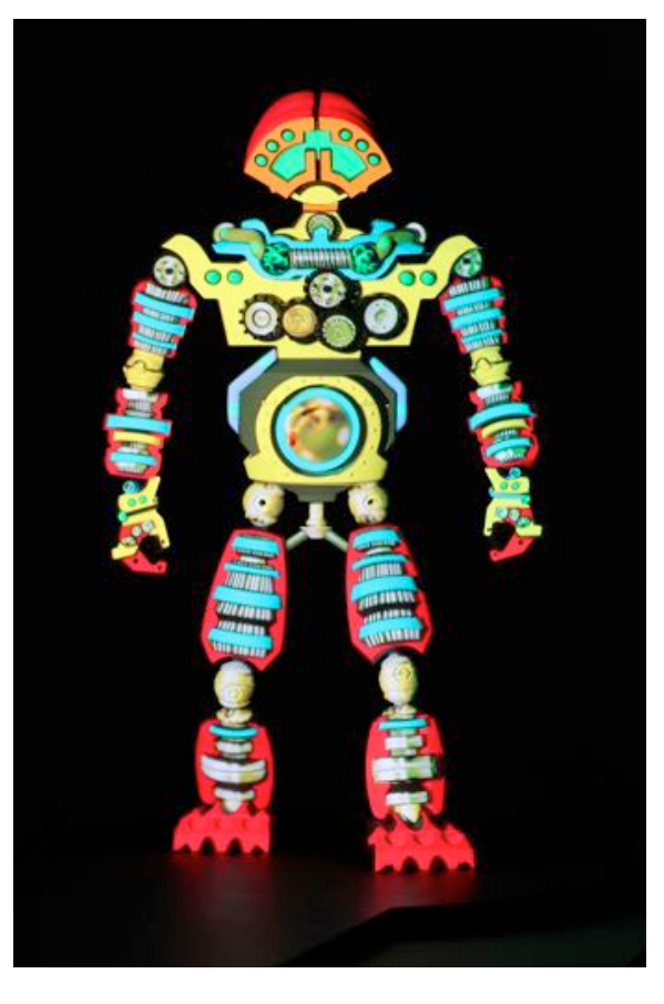
VideoMorphic Figure (Robot 6), 2013 sintered 3D print, powder coated steel and aluminum, video projection, audio

"The Videomorphic figures—a phrase Sarkisian coined to describe the video/sculptural hybrid form—are comprised of