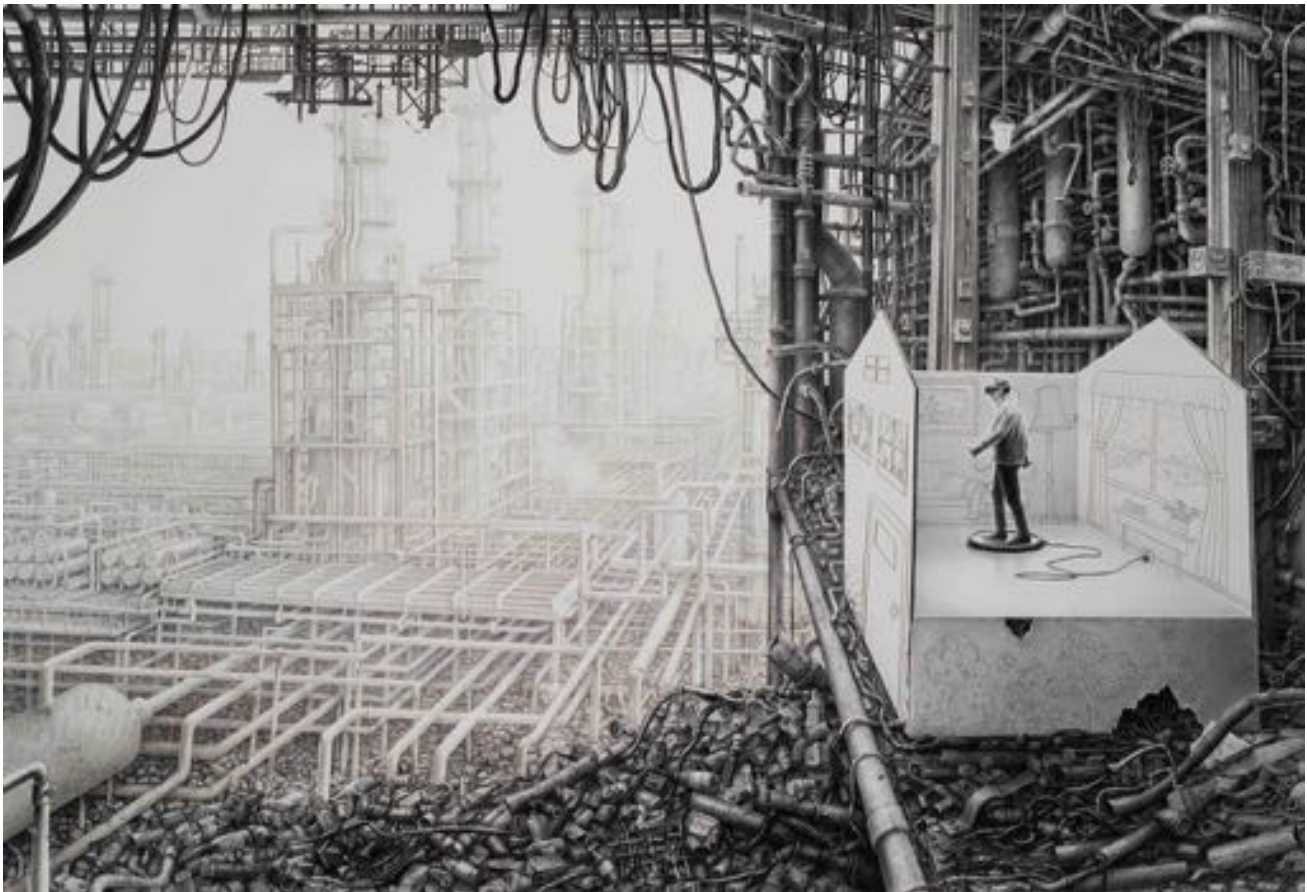
Virtual Reality , 2015, charcoal & graphite on paper, 55 1/2 x 76 1/2 inches