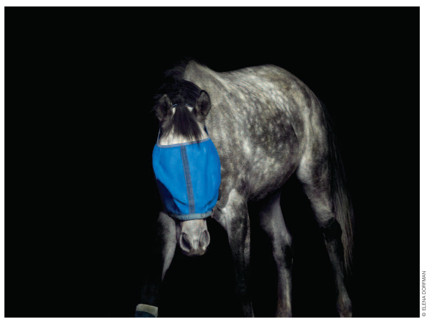
Pleasure Park 7