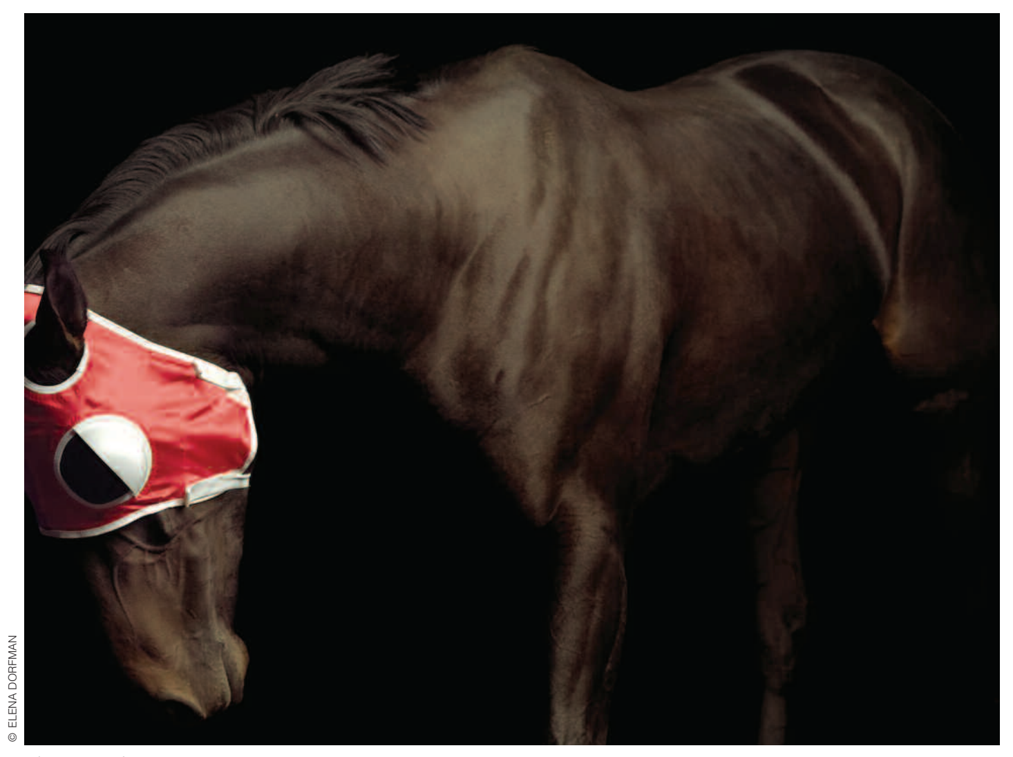
Pleasure Park 10