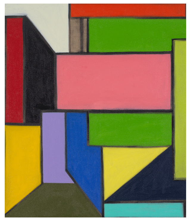
"Vintage", 2013, oil on linen, 38 x 32 inches

The paintings' ancestry goes back through the more severe strain of 1960s color field painting to the roots of abstract art in early 20th century European constructivism. But Arnoldi appears to care less about pedigree than about isolating the difficulty, maybe the impossibility, of viewing abstraction