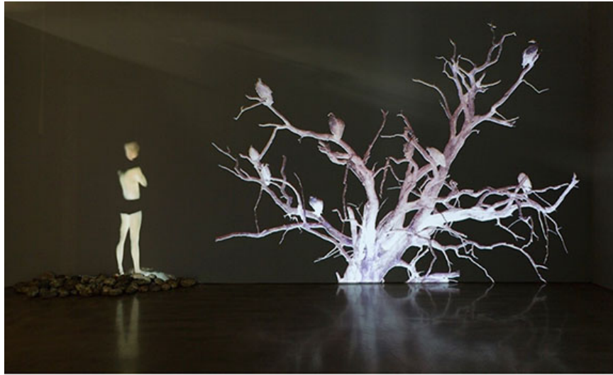
Lookout, 2015, 9:20, video loop